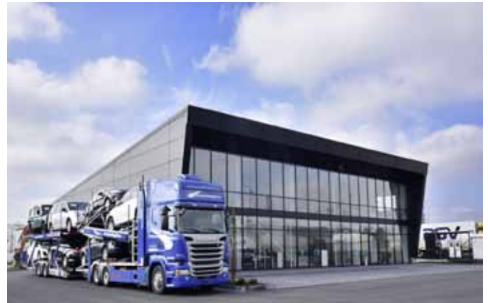
Photo 6: Example reference - a commercial building from Hörmann.