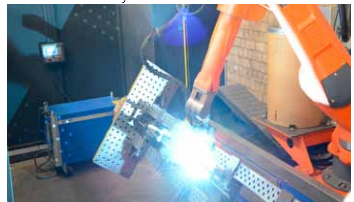
Photo 3: The QIROX QRC-350-E welding robot has 7 axes, thereby greatly simplifying welding of components.

The QIROX QR-CC-40 compact cell for welding smaller components has a 2-station workpiece positioner with vertical change and vertical rotation. By means of the rotary axis the station is turned from the loading area to the robot within 3 sec. During this procedure, the loading area is protected by a light barrier and an additional lateral safety fence. There is a glare shield between the two stations. The system operator therefore has optimal protection and is able to load a station whilst welding is performed on the other station. All robot and positioner axes are fully synchronised. This provides excellent welding results, reduces the secondary processing times and speeds the entire process run enormously.