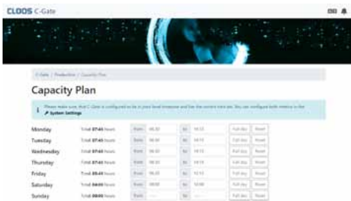
Photo 3: The production module offers extensive planning and evaluation possibilities.