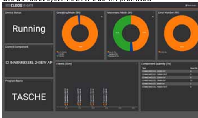
Photo 1: The C-Gate contains a dashboard with many functions for different reference groups.

It is Viessmann's target to digitalise the production process for medium-sized heating boilers completely. In spring 2018 the two project partners first came to an agreement concerning the requirements and priorities for the introduction of the C-Gate. The focus shall be on the monitoring of the systems for a fast error reaction and the documentation of waiting times for optimisation of the production run. "We mainly look at the overall equipment with availability, capacity and quality factors and the component-related key data," explains Bernhard Rothkegel. Already in June 2018, Viessmann could install the C-Gate in three CLOOS robot systems at the Berlin premises.